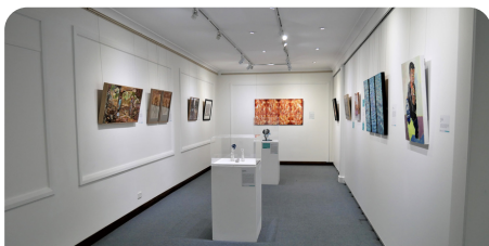
Visit the Dragon's Lair Gallery