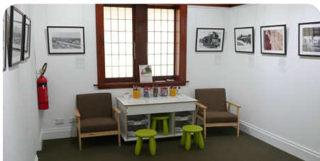
Visit the Snapshot Gallery