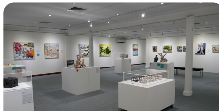
Visit the Main Gallery