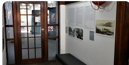
Visit the Hallway Gallery