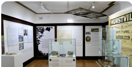
Visit Room 1