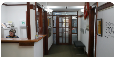
Visit the Front Desk