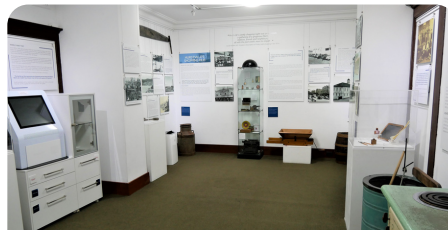
Visit Room 2